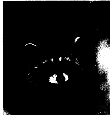
Vaccinating raccoons has been proposed to control diseases such as rabies.

After comparing animals in the vaccination zone to those in another part of the city, the researchers concluded that the vaccine was indeed keeping disease prevalence down—about 1.4 percent of raccoons were infected rather than 8.3 percent. Yet the program did not change