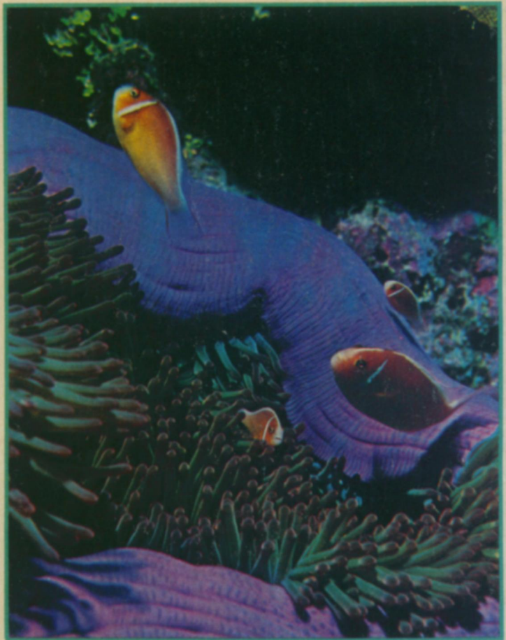
Skunk clownfish in gaudy anemone, Marion Reef, Coral Sea

Working at a distance compounds the technical difficulties — current, suspended particles, poor visibility — intrinsic to underwater photography. The use of the underwater flash enhances color by overriding the natural light and creates an artificial scene. With his Hasselblad and a wide-angle lens, Pitcairn has developed techniques that take advantage of sunlight filtering from the surface, and he captures the unique light and form of the hidden seascape. The results are breathtaking images of both the particular and the general.